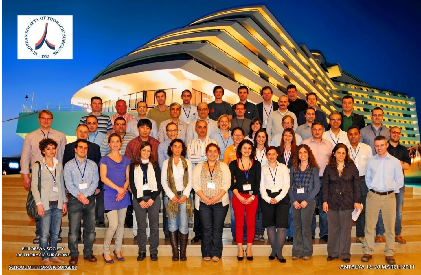
ESTS School of Thoracic Surgery 16-20 Martch 2011, Antalya